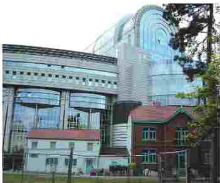
European Parliament in Brussels, Belgium

You might find the Belgian model very complicated. It indeed is very complicated, even for people living in Belgium. But these arrangements have worked well so far. They helped to avoid civic strife between the two major communities and a possible division of the country on linguistic lines. When many countries of