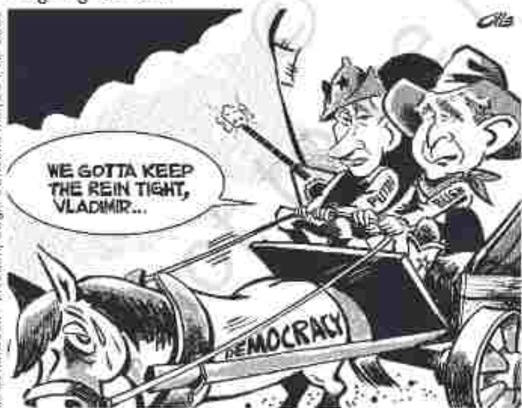
Reigning the Reins

In 2005, some new laws were made in Russia giving more powers to its president. During the same time, the US president visited Russia. What, according to this cartoon, is the relationship between democracy and concentration of power? Can you think of some other examples to illustrate the point being made here?